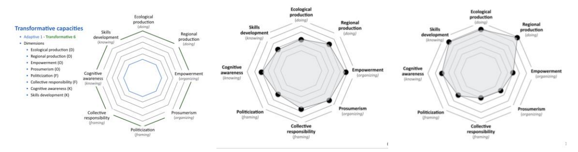
Figure 2: Evaluation of transformative capacities; conceptual grid and two case examples (food co-op 1, community food growing 2)

For the study of transformative capacities of the urban food movement, the four dimensions were specified using the related goals stated by the founders and discussed above (2.1). To sum up, as far as doing is concerned their main focus is on fair ecological and regional production. With regard to organizing , they essentially demand the integration of producer and consumer perspectives (prosumerism) and greater participation in relevant decision-making. They want to free the current narratives ( framing ) from their industrial understandings and instead make food production and consumption more politicized and a matter of collective responsibility. In terms of knowledge , they aim to both change practical skills and spread cognitive awareness of the current lack of sustainability. In a second step, we evaluated all examined projects based on the case dossiers created in these eight subdimensions on a scale from 1 (merely adaptive) to 6 (very transformative). It became clear that, although all the projects generally take into account all dimensions, they certainly set different priorities. The differences were presented in spider diagrams and discussed at a workshop with the partners.