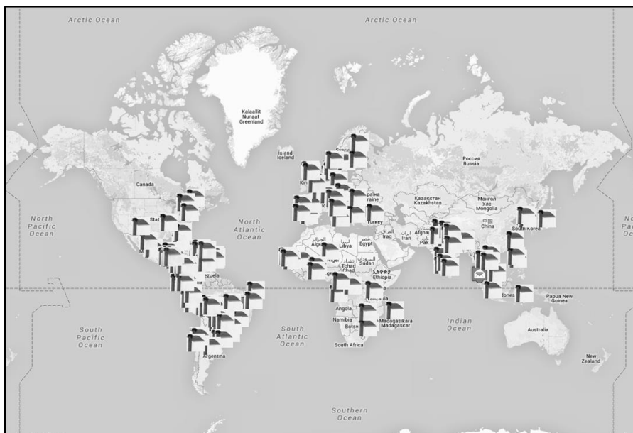
Figure 1. The LVC movement around the world